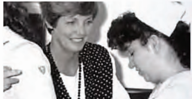
Her kindness was evidenced by her smile.

This sparsely populated area of northwestern Ohio holds some of the nation's richest agricultural soil, and long has attracted migrants to help work the fields.