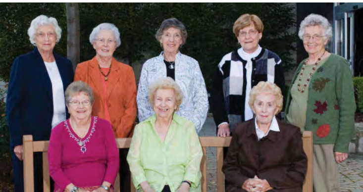
Class of 1950