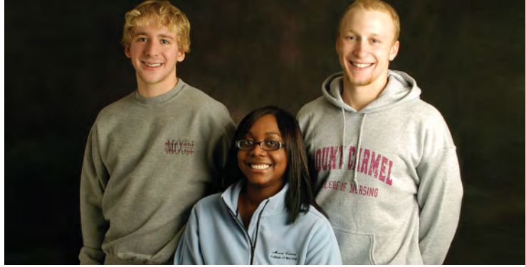
MCCN students showing off the new Mount Carmel spiritwear

everyone has a story. We look forward to hearing yours.