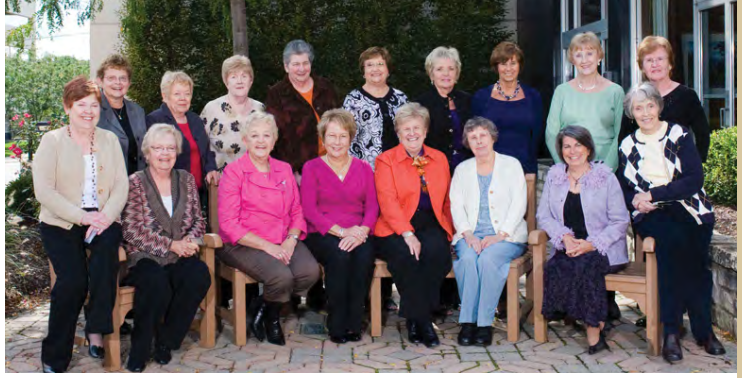
Class of 1960