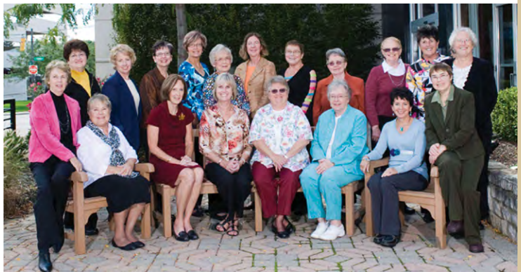
Class of 1965