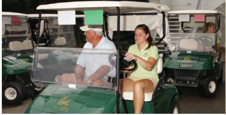
Student volunteers make an important contribution to the Golf Invitational

The Mount Carmel Foundation hosted the 16th annual Golf Invitational on July 12, at The Lakes Golf and Country Club in Westerville, Ohio. Funds raised benefit MCCN students, men and women pursuing their dreams of becoming professional registered nurses.