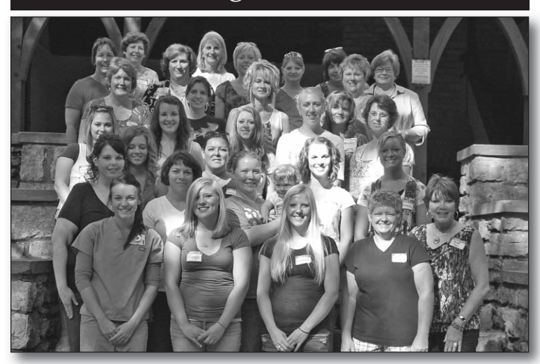
MCCN-FMC students and faculty had a great time at the annual picnic held earlier this month in Lancaster. The picnic was a perfect opportunity to reconnect, meet new students and welcome the start of a new academic year.