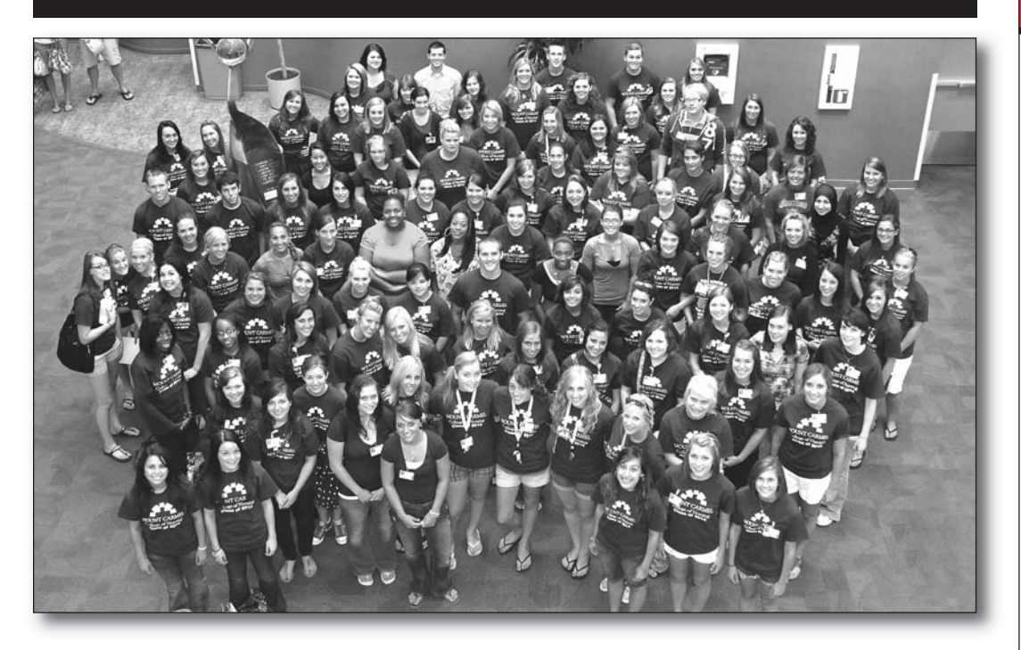
They're on their way to becoming nursing professionals. . .