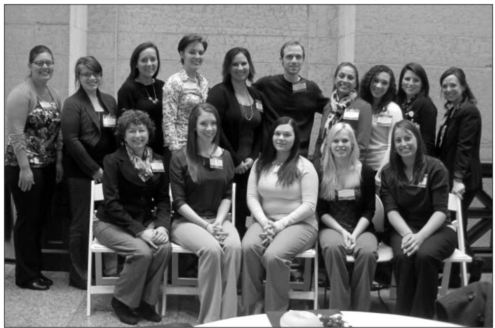
Prelicensure students participate in the events at Nurses Day at the Statehouse

What legislative bill gives new authority to nurses in the determination and pronouncement of death? What House Bill increases penalties for violence against nurses in hospitals?