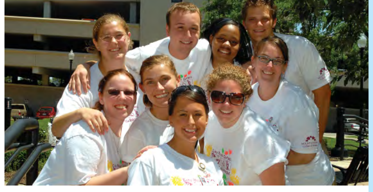
MCCN students enjoy serving as Camp Mount Carmel counselors.

Camp Mount Carmel offers shadowing experiences in the camper's choice of a healthcare specialty track: dietetics/ nutrition, nursing, pharmacy, physician practice, physical therapy/speech therapy/occupational therapy, radiology, respiratory therapy.