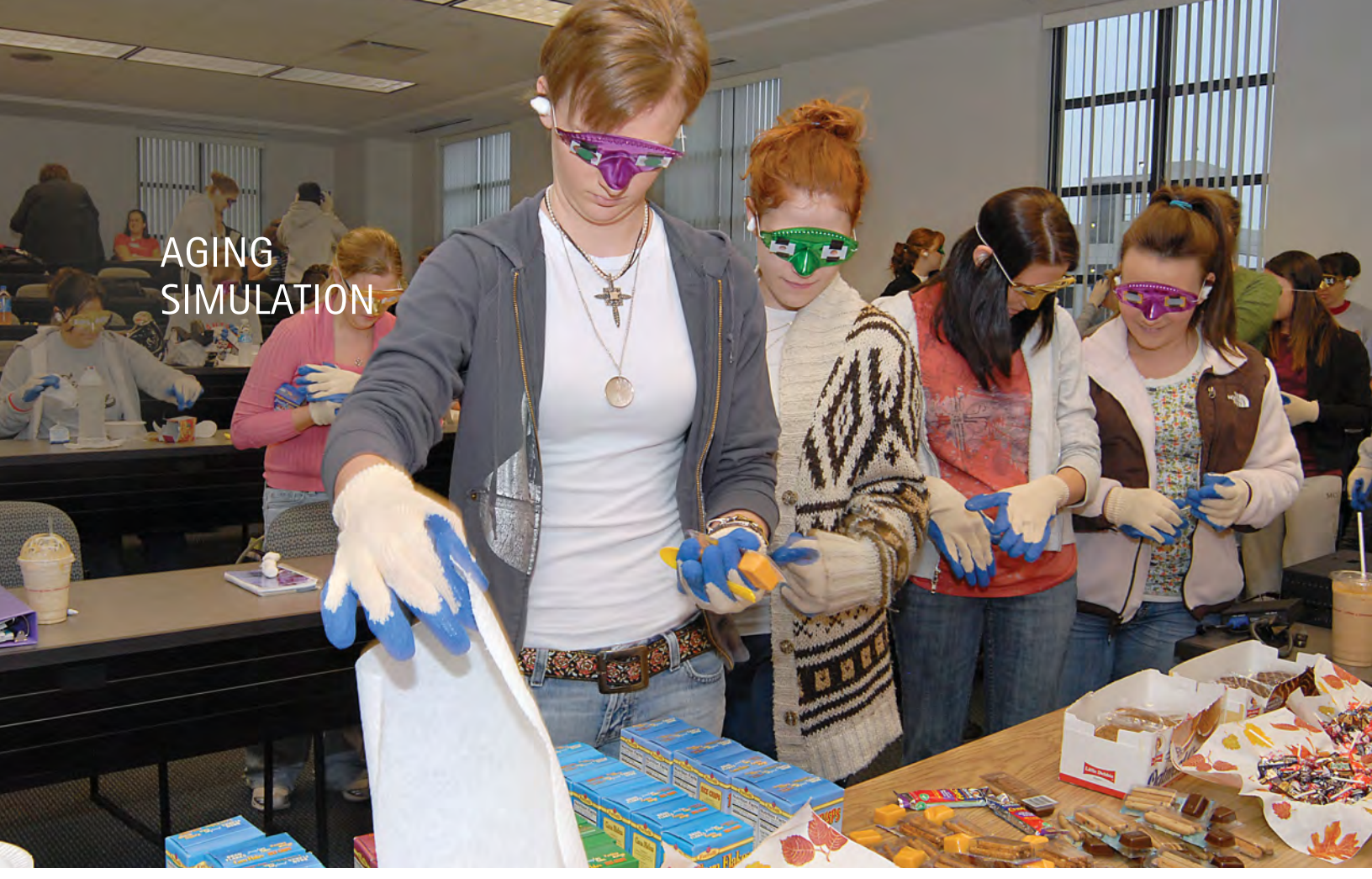
Gearing up for an innovative lesson on caring for older adults are senior nursing students at MCCN.