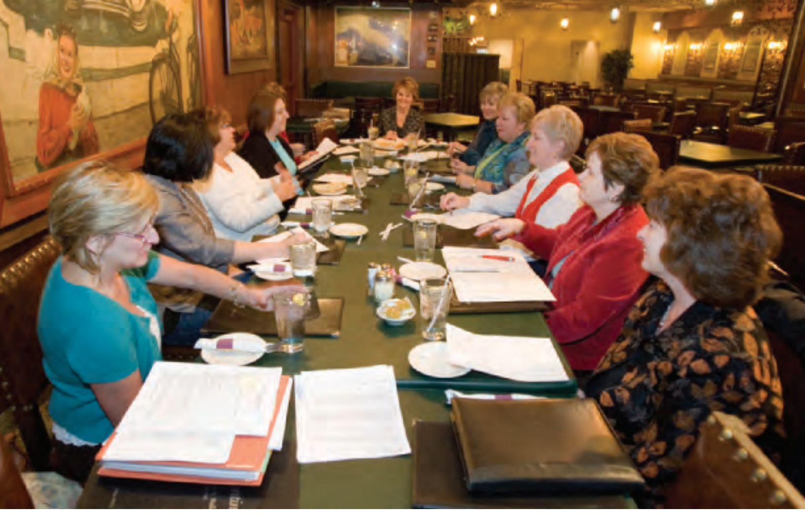
Fun, friends, and the Florentine...Mount Carmel Alumni Association meetings combine commitment and celebration.