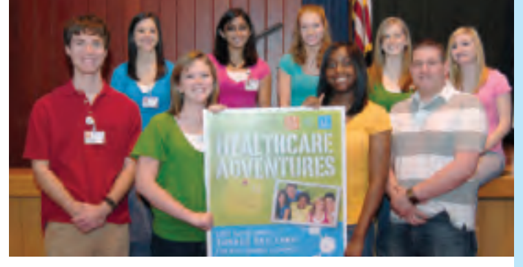
Camp Mount Carmel Counselors

An exciting and educational summer experience, Camp Mount Carmel: Adventures in Healthcare, will be held June 14 -17, 2010. MCCN again hosts and MCCN students serve as counselors for this popular summer day camp exploring healthcare careers. This year's new format: one week for high school students entering grades 9, 10, 11 and 12.